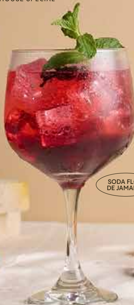
SODA FLOR DE JAMAICA