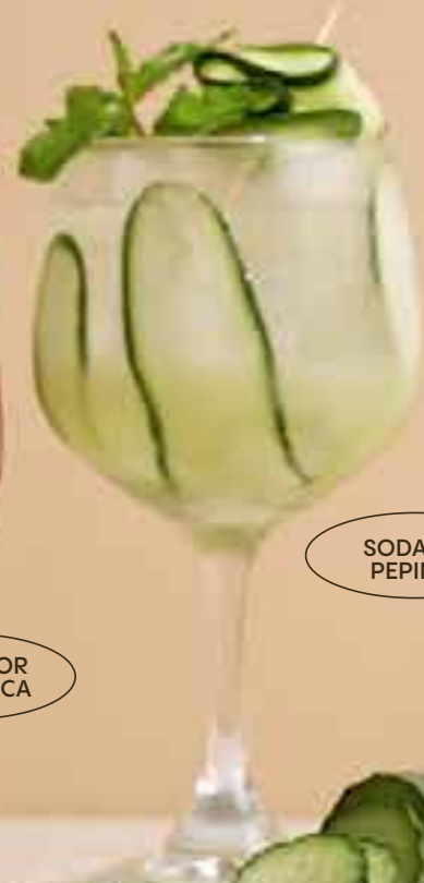
SODA DE PEPINO