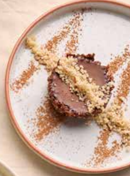
TARTA RAW DE CHOCOLATE