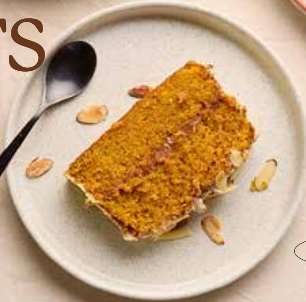
TORTA DE ZANAHORIA