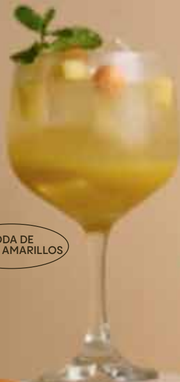
SODA DE FRUTOS AMARILLOS