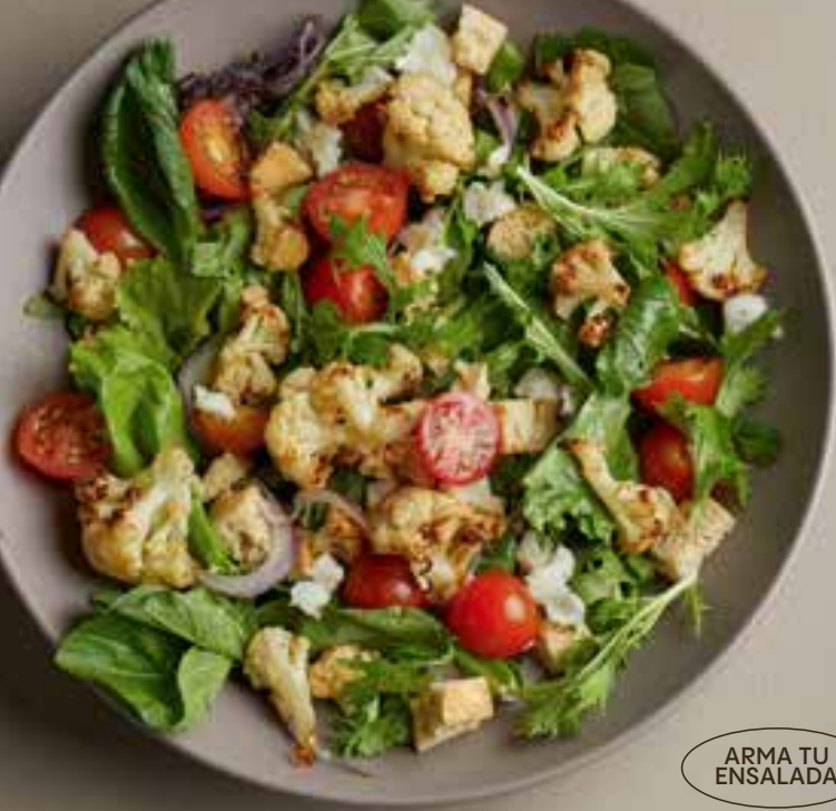
ARMA TU ENSALADA